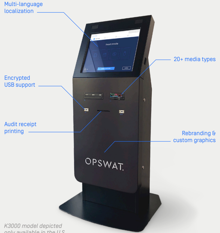
K3000 model depicted only available in the U.S.

MetaDefender Kiosk lets you trust all portable media that enters or exits your facility.