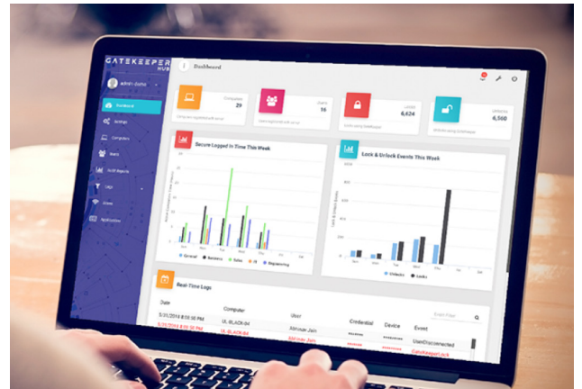
Enterprise Hub provides an easy way to administer security policies for all computers and users on the network, while detailed access logs verify authenticity of users logging onto a company's network locally or remotely.

Each user is provided with a GateKeeper Halberd or Smart Badge. Plus with the Trident App, users can use their smart phone as a wireless key. Wireless keys (tokens) are registered for each person on the server and serve as a unique identifier for that individual. The Tokens will be detected and used for authentication when the individual logs into their computer.